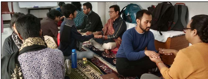
A scene from the second day of the third edition of Varta Trust Mental Health Peer Counselling Training for queer community members in West Bengal.

Position statement: Varta Trust looks at gender and sexuality through the prism of intersections with age, class, caste, religion, race, marital status, geographical location, sexual and reproductive health, HIV, disability, mental health, education, livelihood, social security, environment and human rights concerns.