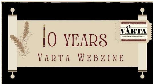
Varta Facebook page banner to mark the completion of 10 years of Varta webzine in August 2023.

Position statement: Varta Trust looks at gender and sexuality through the prism of intersections with age, class, caste, religion, race, marital status, geographical location, sexual and reproductive health, HIV, disability, mental health, education, livelihood, social security, environment and human rights concerns.