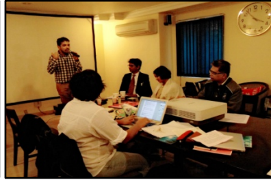
Kolkata consultation, 2019