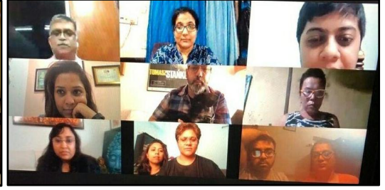
Online roundtable, 2020

Our mentoring process: First, we assess what qualifications, skills, and experience the aspirants who approach us already have, and what they are looking for. Next, we guide them to create or improve an existing CV, which is circulated among the mentors for further inputs on the CV and guidance and references for relevant opportunities. We collate the inputs received from the mentors, share them with the aspirants, and facilitate one-on-one conversations between the aspirants and specific mentors as needed. We continue to guide them for the next steps in applying for a training programme or job, or setting up or upgrading an enterprise. We plan to provide follow-up support till around six months for the aspirants who manage to start off on a training, job or enterprise with our support.