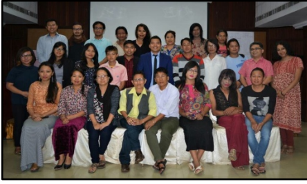
Entrepreneur sensitization, Imphal, 2017